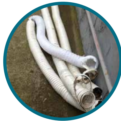
Example Of Plastic Vents That Can Cause A Fire Hazard.