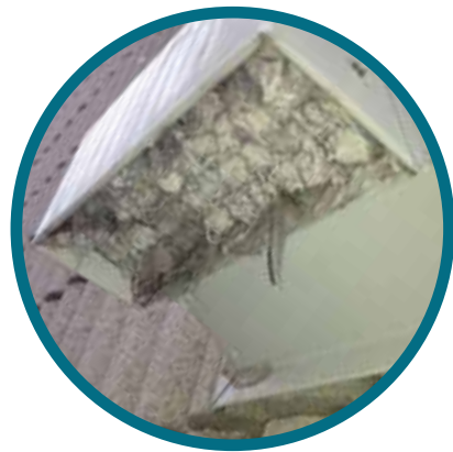
Roof Exhaust Vent Blockage

Lint Check™ Dryer Vent Systems, Safety Services, Helps Prevent Dryer Fires® by removing the hazard of combustible lint inside the Dryer Vent Systems and maintain peak efficiency with the dryer.